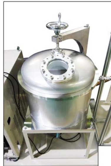
Vacuum chamber Equipped with Sight glass and Fastening Clamp