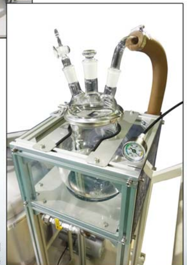
Sealing liquid supply device